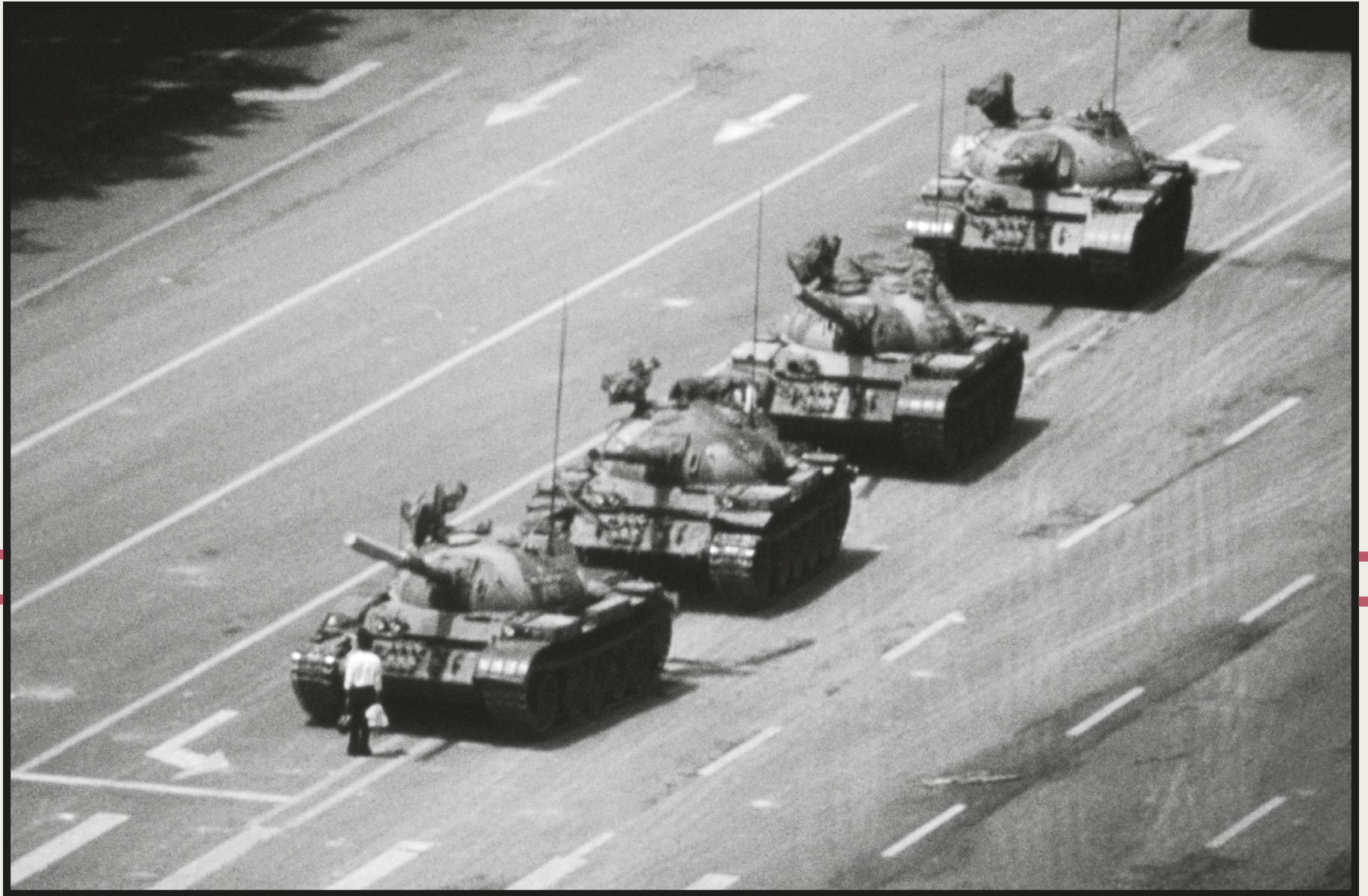
TANK MAN. China, Beijing Tianamen Square. 4th June 1989