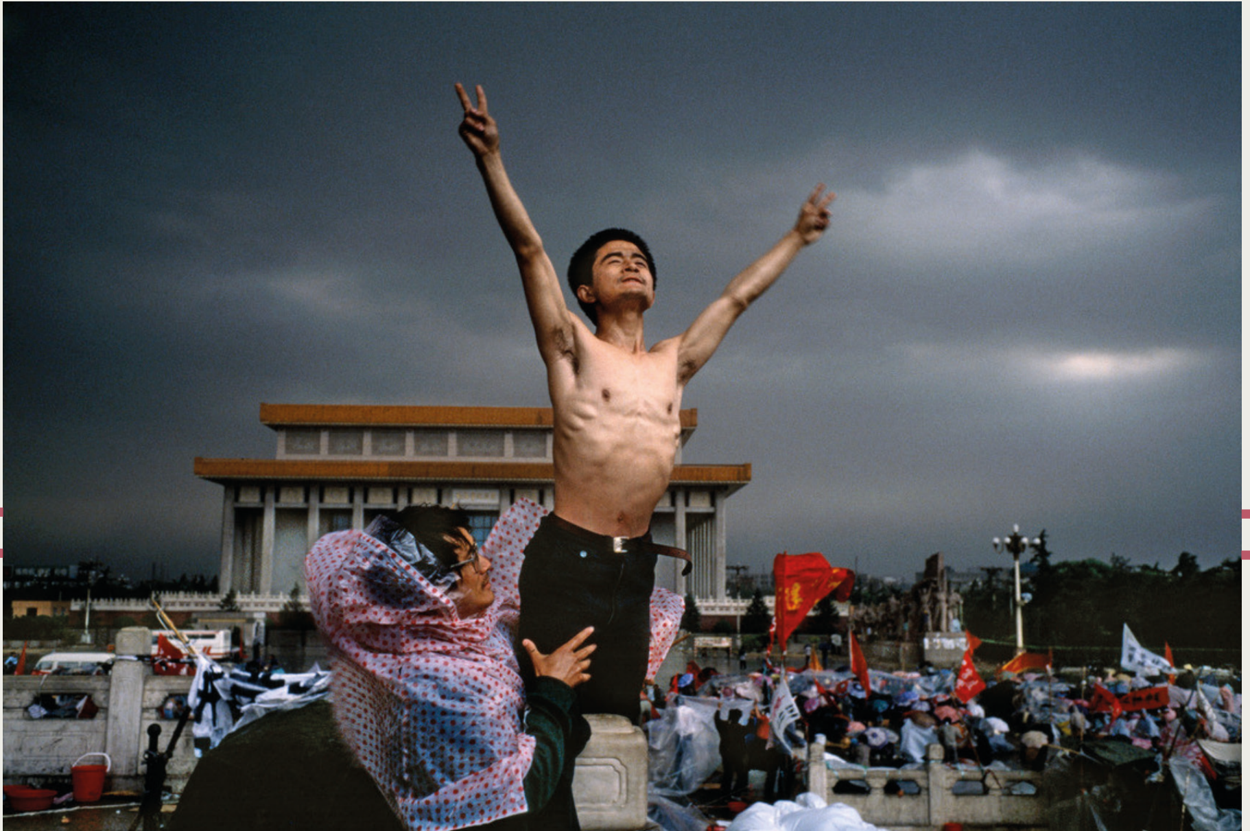
Tianamen Square. Beijing, China. 1989