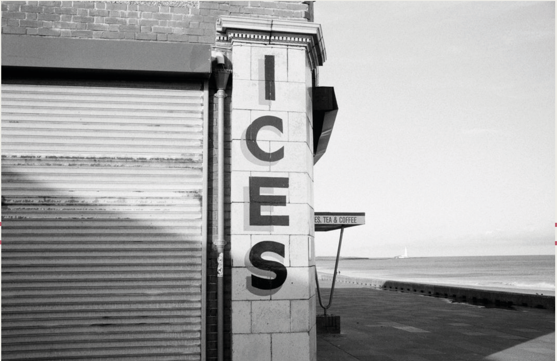
Whitley Bay England 2002