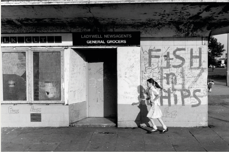
Fish and Chips Salford, England. 1986