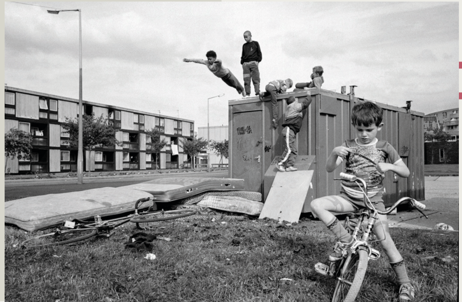
Moss Side Estate Manchester, England. 1986