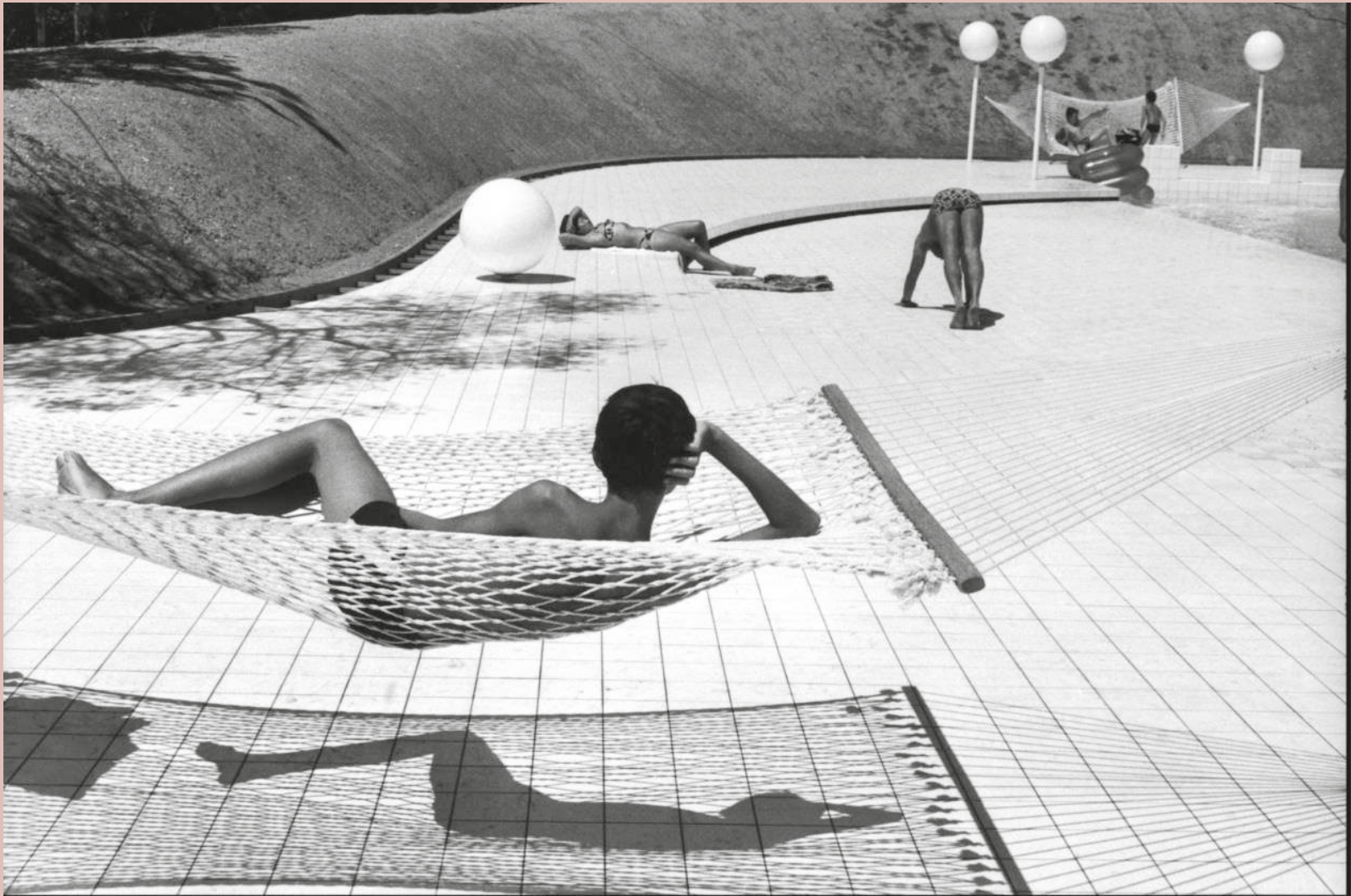
Swimming pool, designed by Alain Capeilleres La Brusc, Var, France 1976