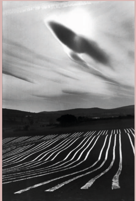
Melon plantation. Montjustin. Haute-Provence. 1976