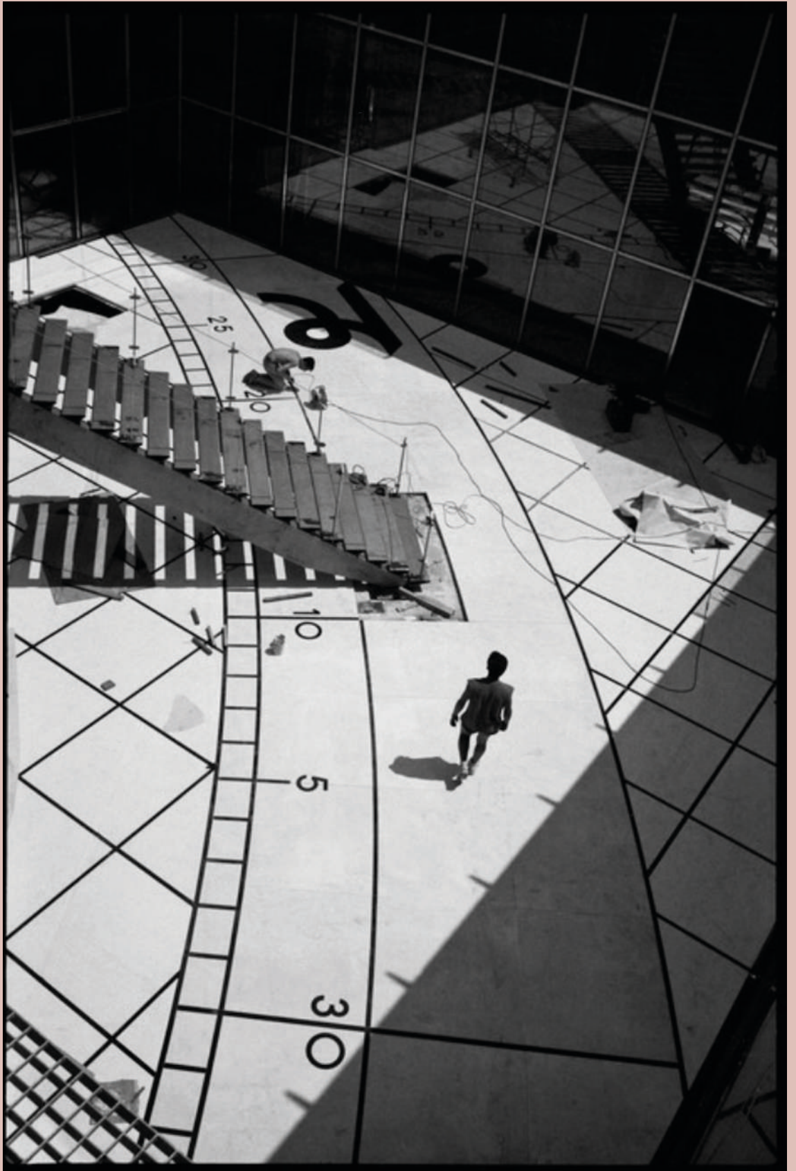
Grande Arche de la Defense Paris, France. 1989