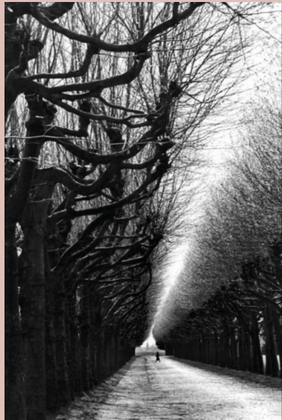
Meudon observatory Seine-et-Oise. France 1989