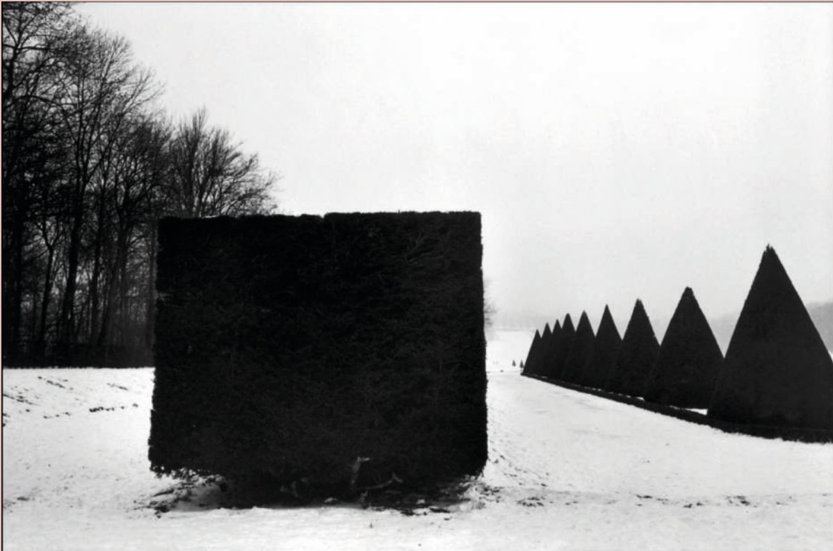
The Park at Sceaux Hauts-de-Seine. France 1987