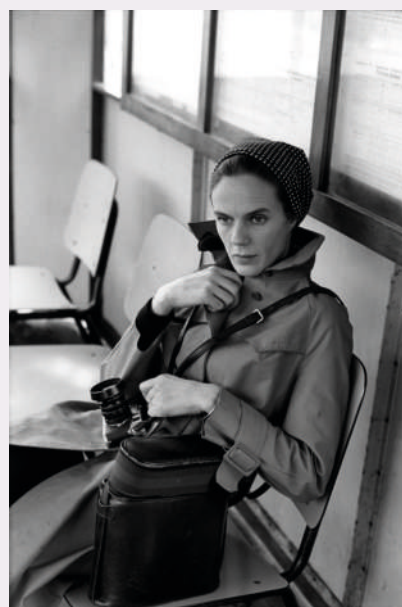
Martine Franck, Italy 1972 by Henri Cartier-Bresson ©Fondation Henri Cartier Bresson/ Magnum Photos

Her art is a reflection of a personal touch symbolized by geometry, curves and lines, in search of the beauty of the human soul and the depth of hearts and minds, all captured in an instant. This artistic expression made her an artist with an exceptionally sensitive eye.