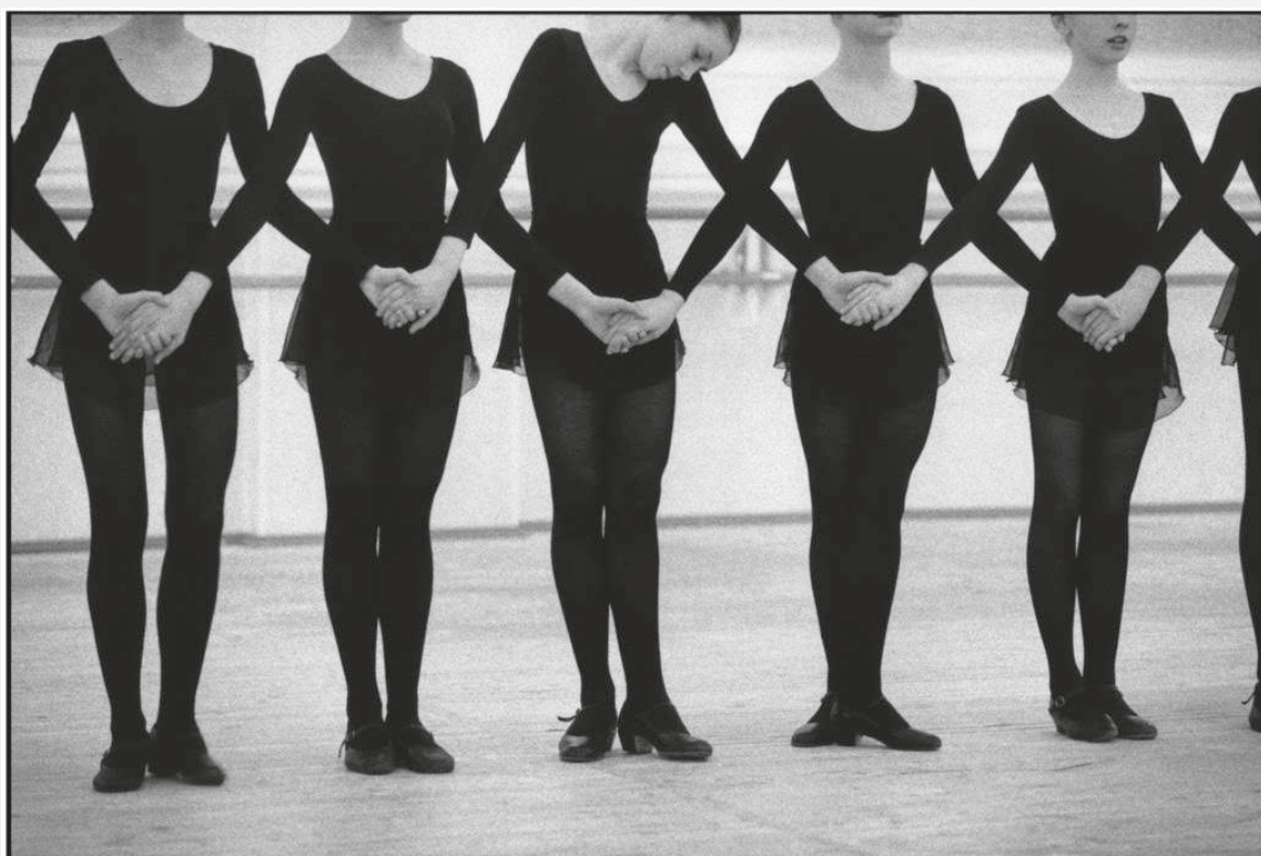
Rehearsal. Ballet Moisseev. Moscow Russia 2000

1993 Le Theatre du Soleil, Bradford, England