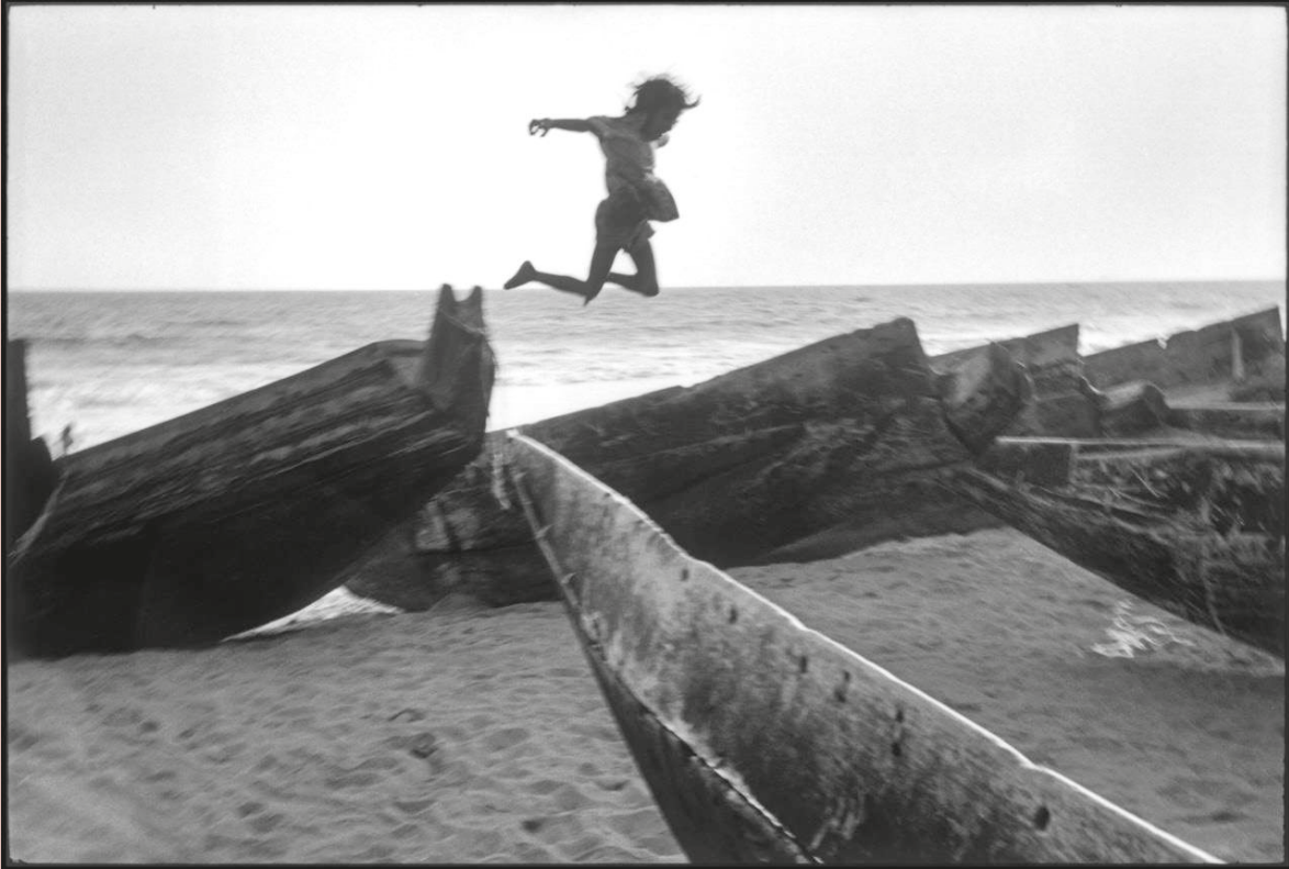
The beach at Puri, Orissa, India. 1980