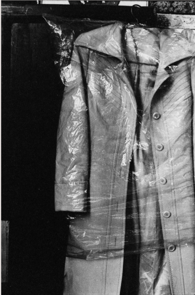
Abrigo de Teresa. 1980/83

Working as a photographer under the dictatorship was difficult: -If I had my camera, I ran the risk of being detained in the street. It was almost impossible to take photos, that's why in my images, the people are small as I photographed from a distance.