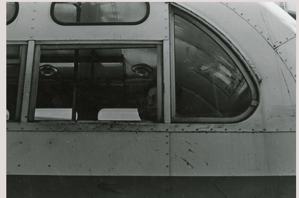
Santiago, 1980/83 (top)