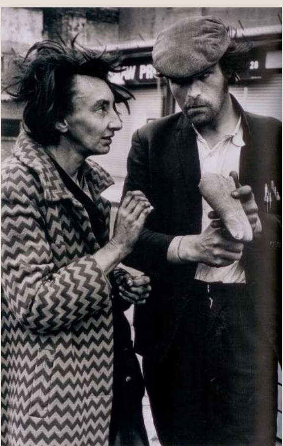
Woman and man with bread. Spitalfields London 1976