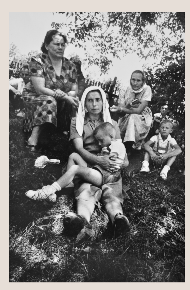
People sitting outside church during mass Trhoviste, Slovakia. 1965