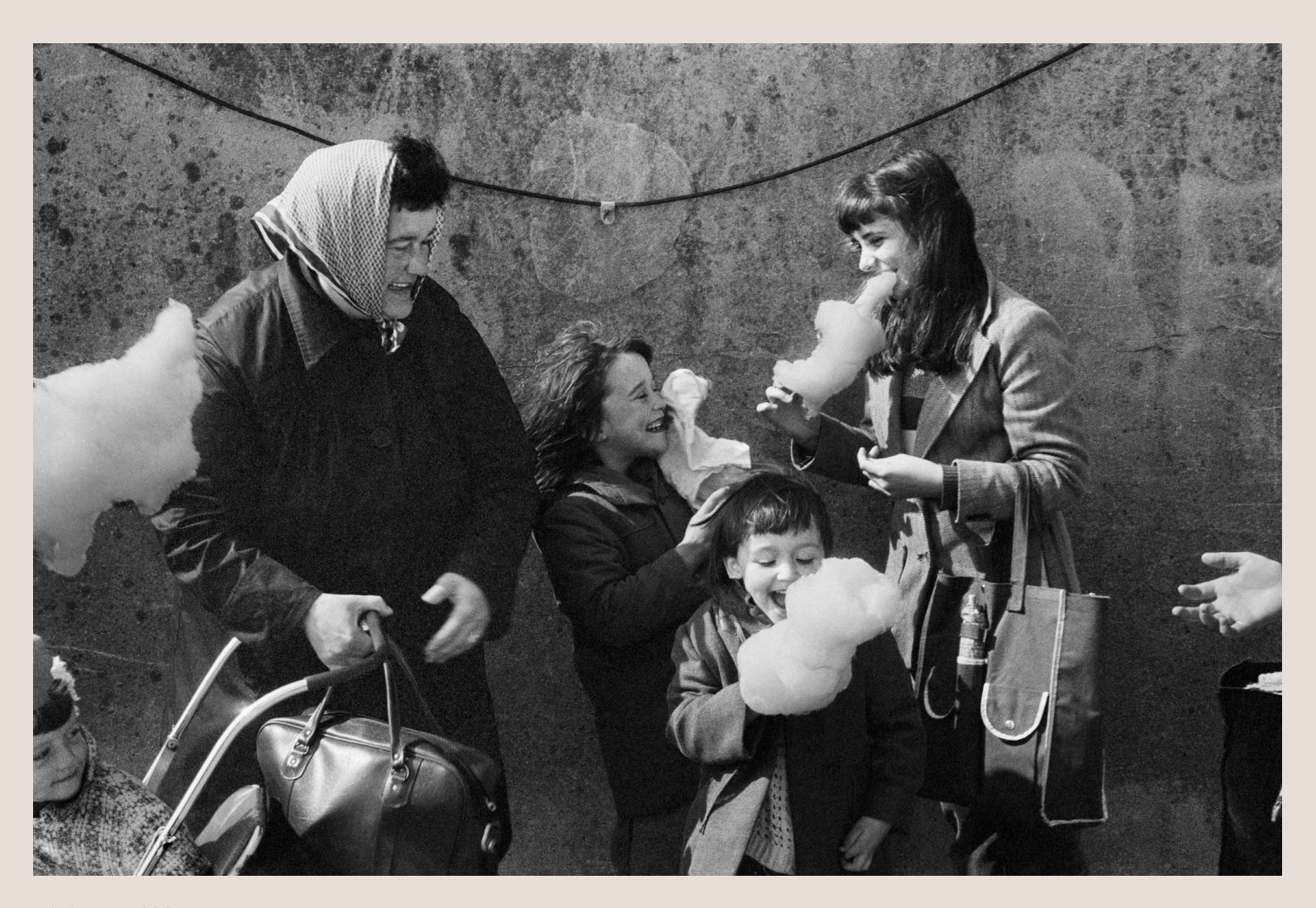
Whitley Bay. 1980