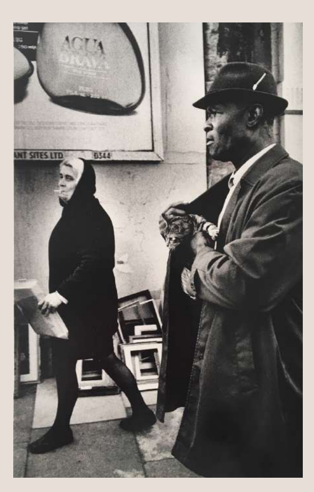
Man with kitten. Christmas Eve. London 1975