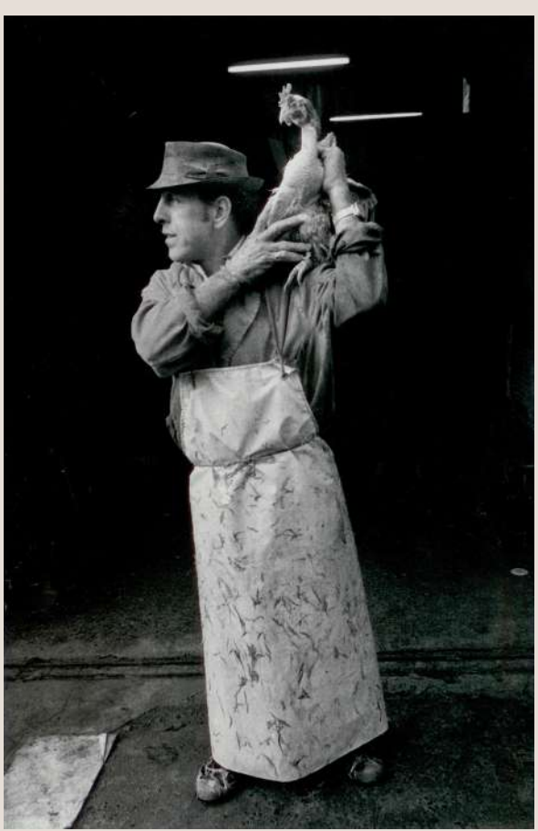
Man with the chicken. Leyden Street London 1976