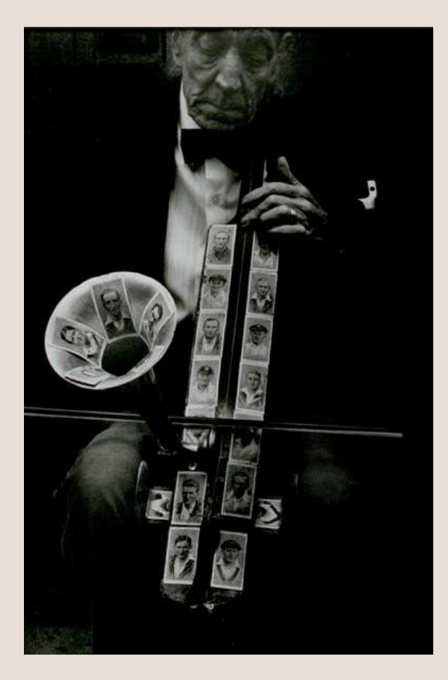
Ginger with homemade Sax. Cheshire Street. Spitalfields. London c. 1975