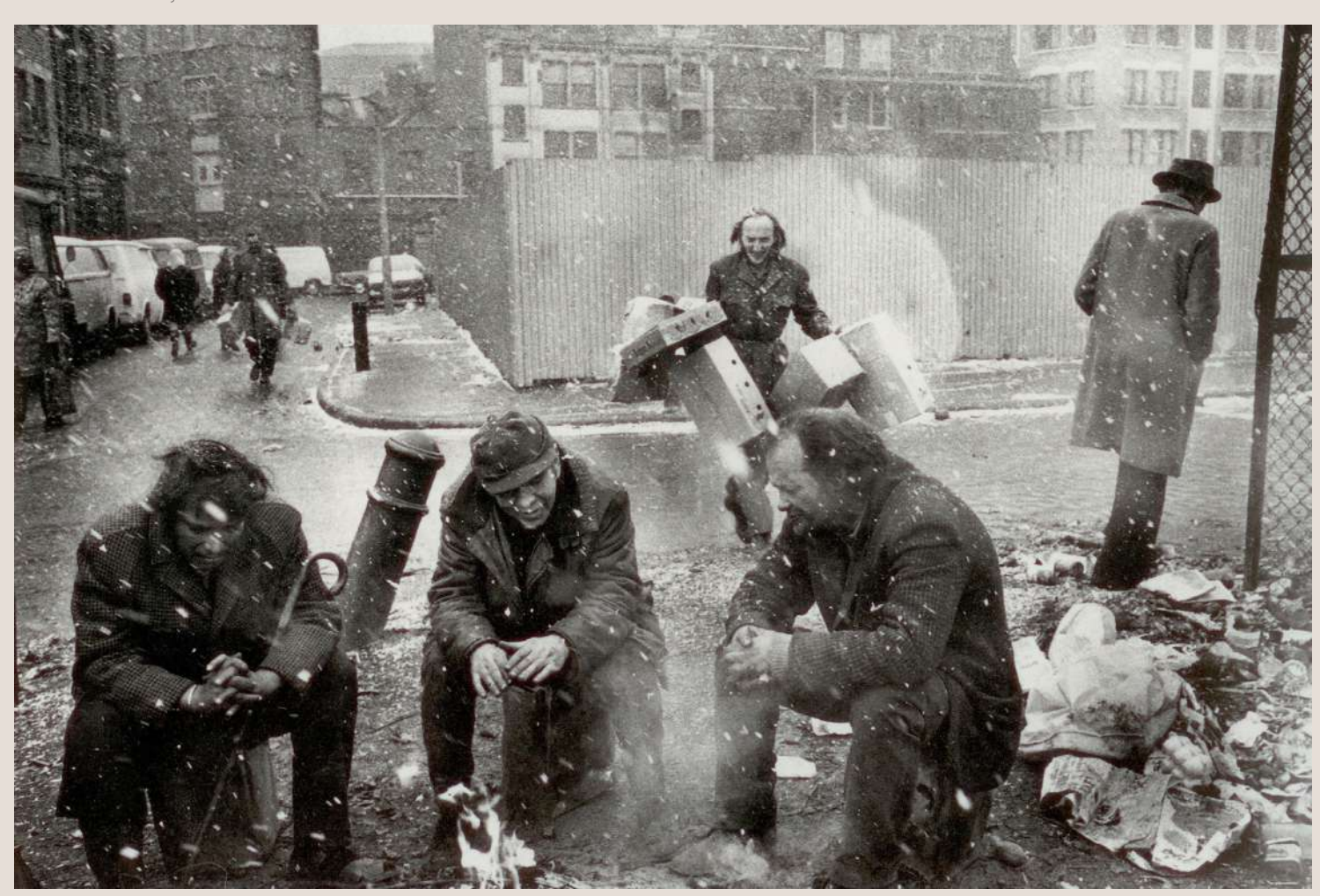
People around a fire, Spitalfields Market. London 1976