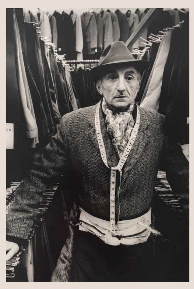
Man selling trousers.. Petticoat Lane London 1974