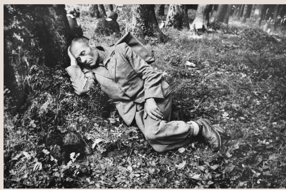
Sleeping Pilgrim. Levoca, Slovakia. 1968