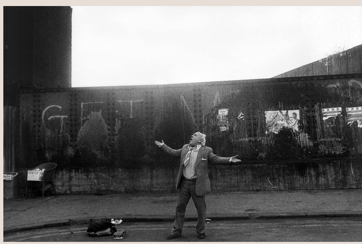
Man singing on Brick Lane. London 1982