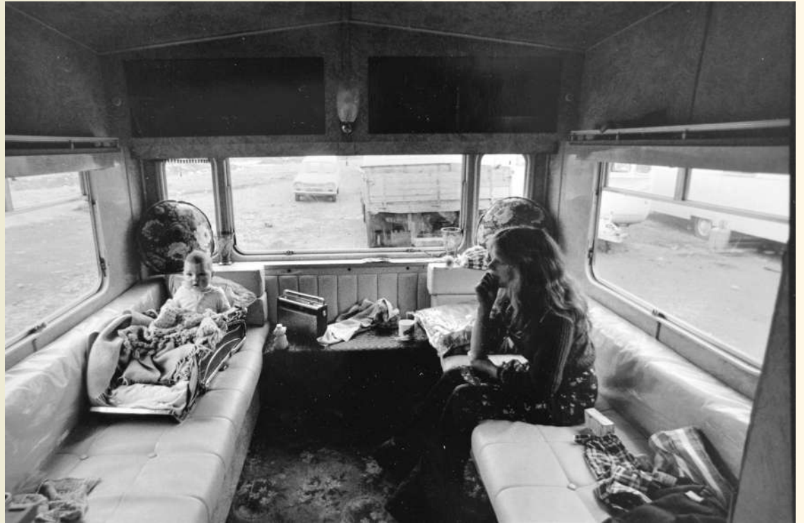
Leeds Travellers 1974