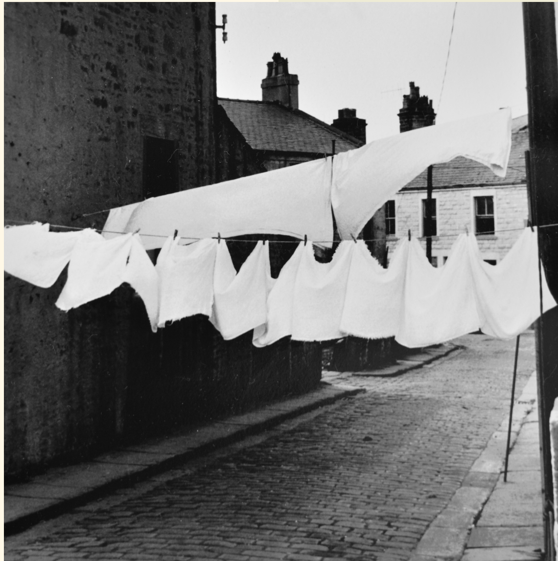
Nappies on washing line Sheffield 1974