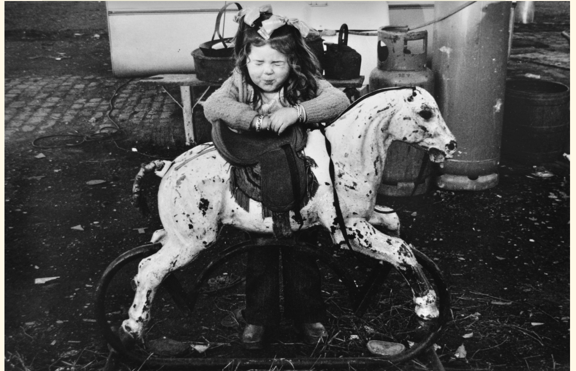
Leeds Travellers 1974