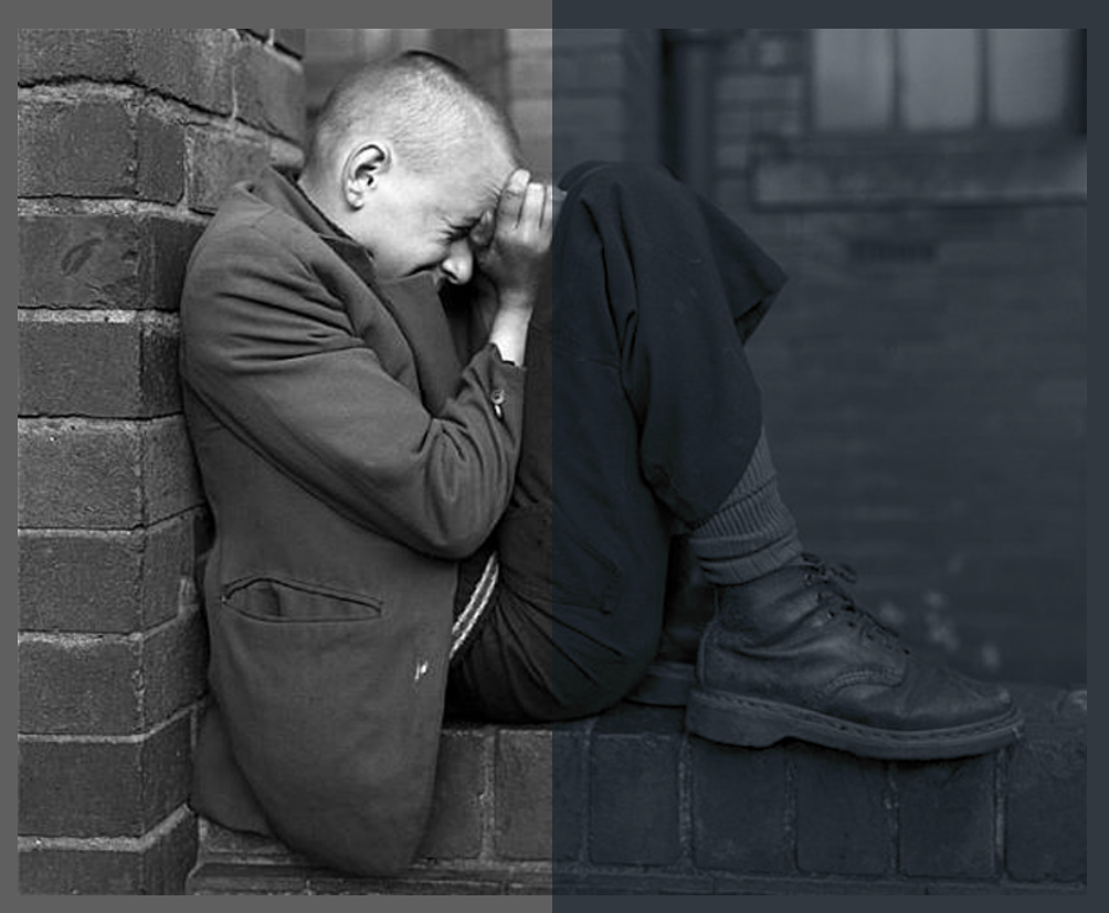
Youth on Wall, Jarrow, Tyneside, 1976