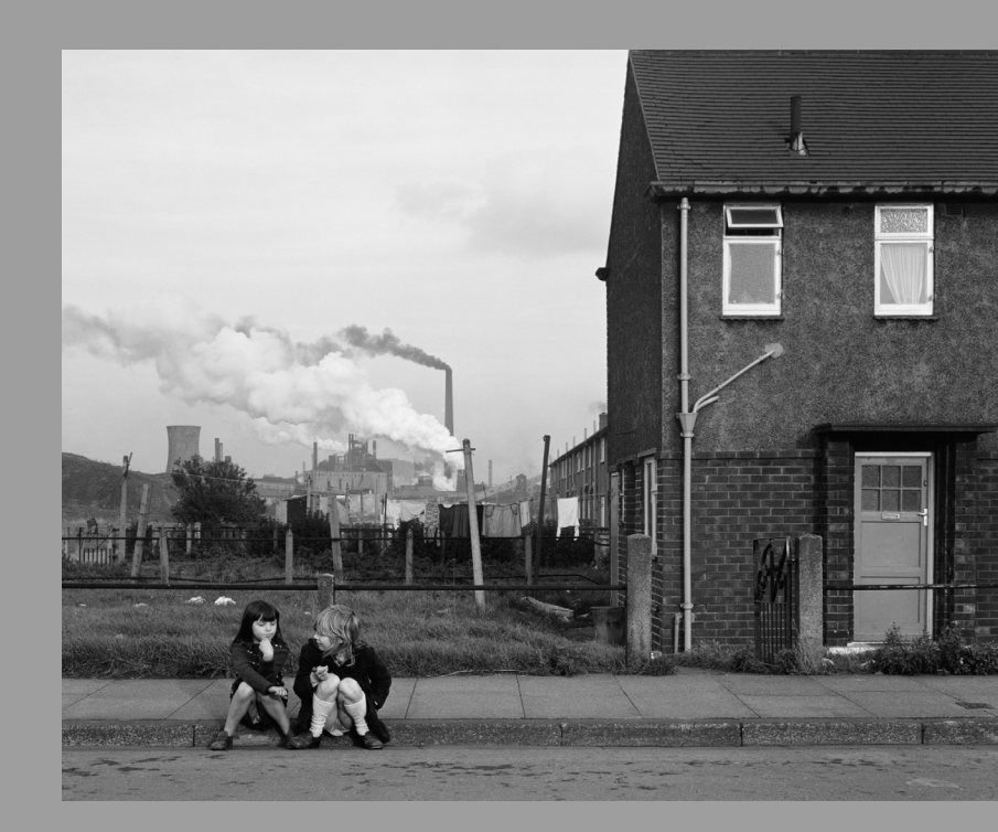
Two Girls, 1977 Grangetown, Middlesbrough