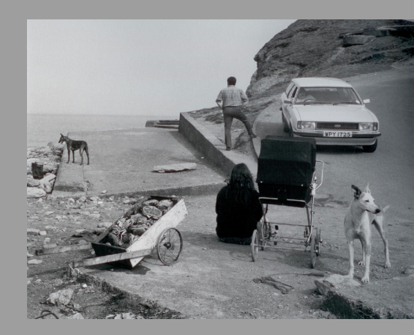
Crabs and People, 1981 Skinningrove, North Yorkshire

Augusta Edwards Fine Art · 4 Cromwell Place · London SW7 2JN · London UK· augusta@augustaedwards.com