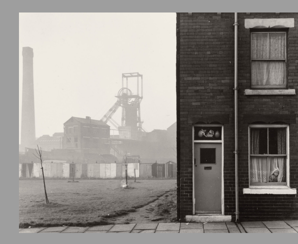
House and Coalmine, 1978 Castleford