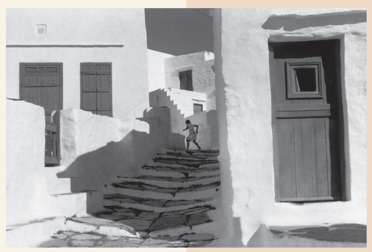
Sifnos, Greece. 1961