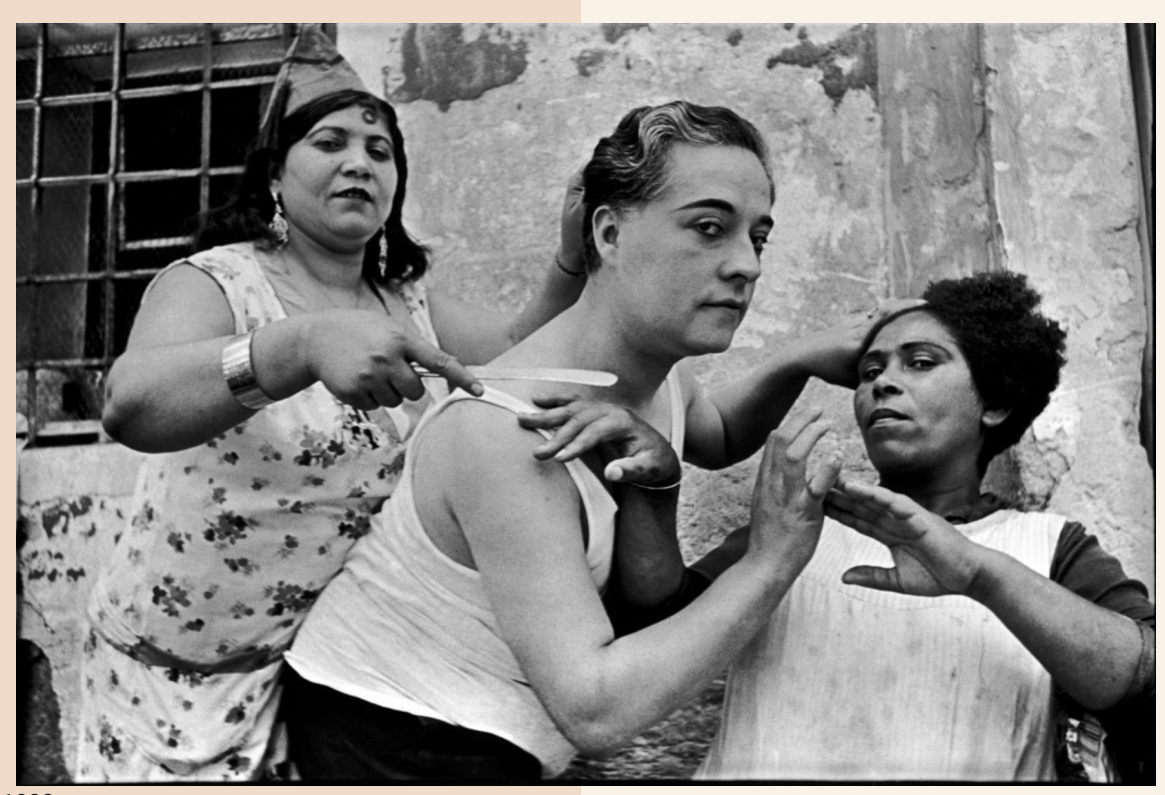
Alicante, Spain. 1933