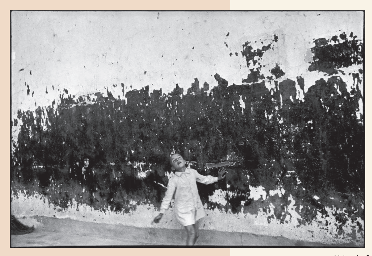
Valencia, Spain. 1933